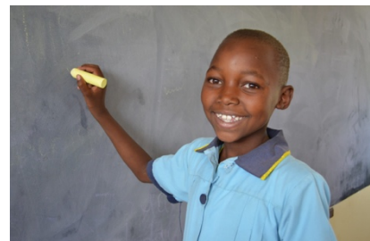
2013 - Year 3