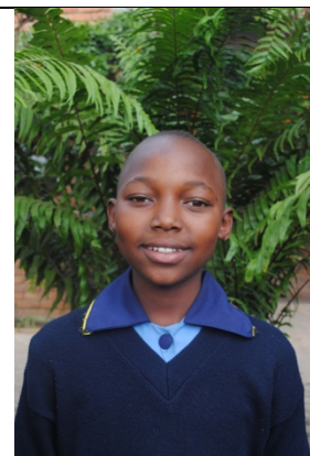
2016 - Year 6