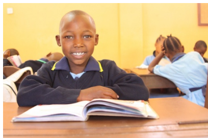
2012 - Year 2