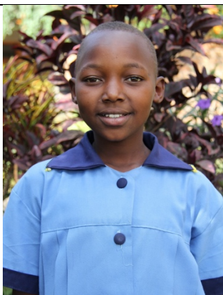
2015 - Year 5