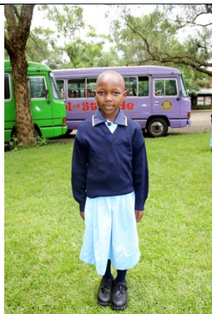
2011 - Year 1