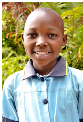
2014- Year 4